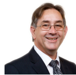
Mick Antoniw Welsh Labour Pontypridd