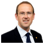
Llyr Huws Gruffydd Plaid Cymru North Wales