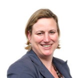
Antoinette Sandbach Welsh Conservatives North Wales